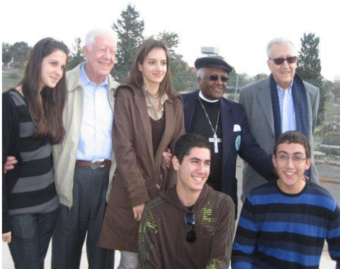
Two Pairs of CFP Teens Spent Several Days with Former President Jimmy Carter, Archbishop Desmond Tutu, and Lahkdar Brahimi

Please join us in promoting friendship, understanding, trust, and peace!